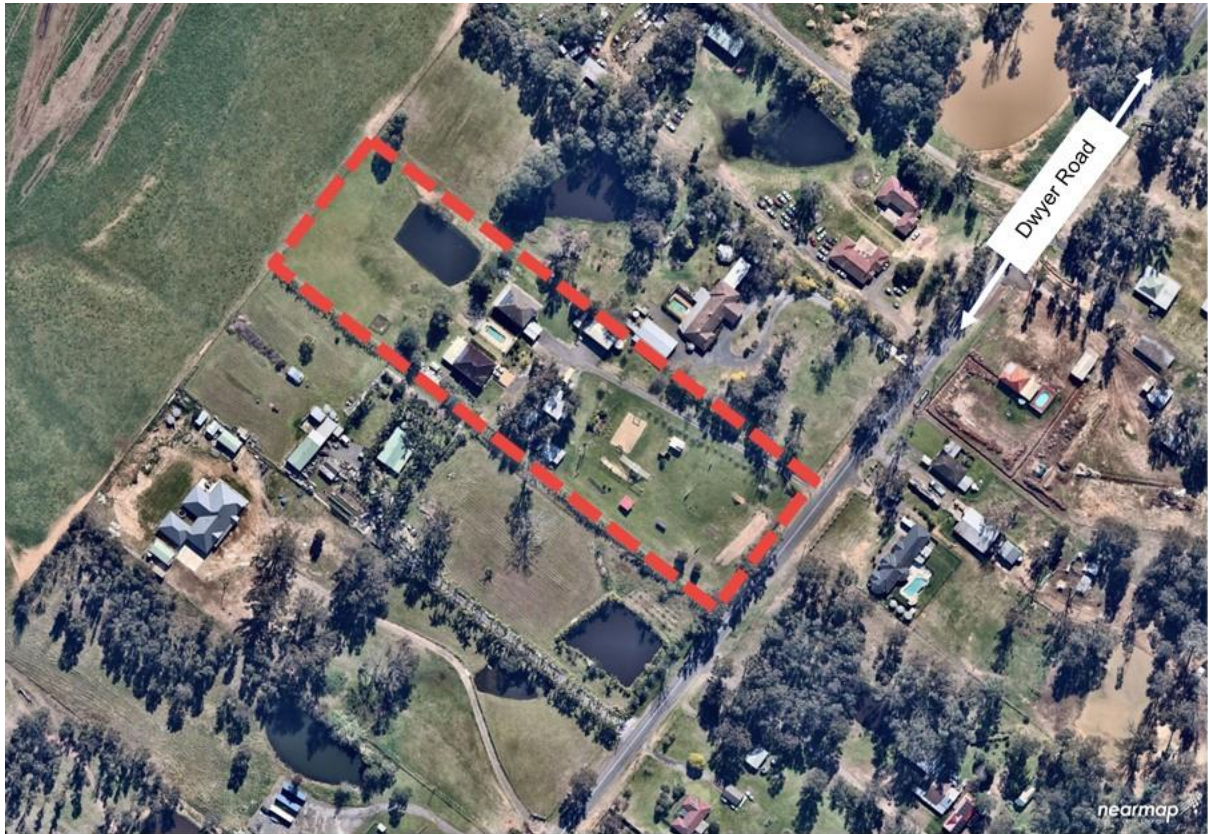
Figure 1: Aerial view of subject site