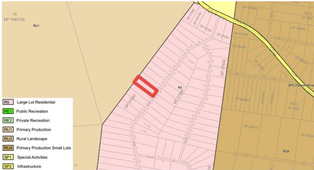
Figure 3: Existing land use zoning in the LEP (subject site outlined in red)

The objectives of the R5 – Large Lot Residential zone are: